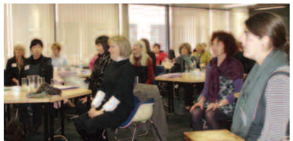
Women's Conference Participants

The history of wins for women workers by the PSA and other unions, and the importance of organising women to continue to win further improvements, was highlighted.